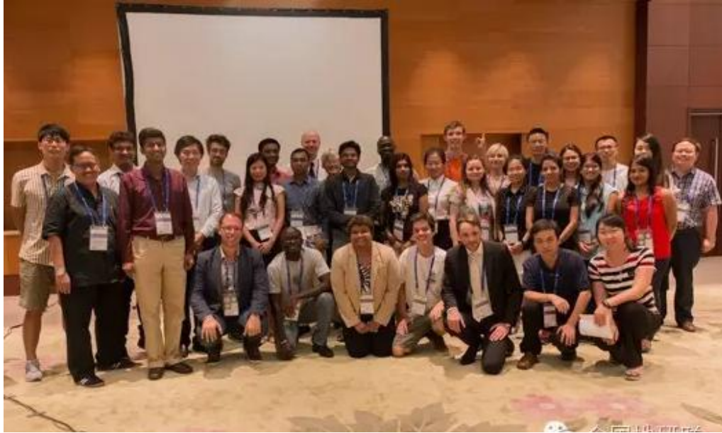
IGU-YECG Launching Ceremony, 2016