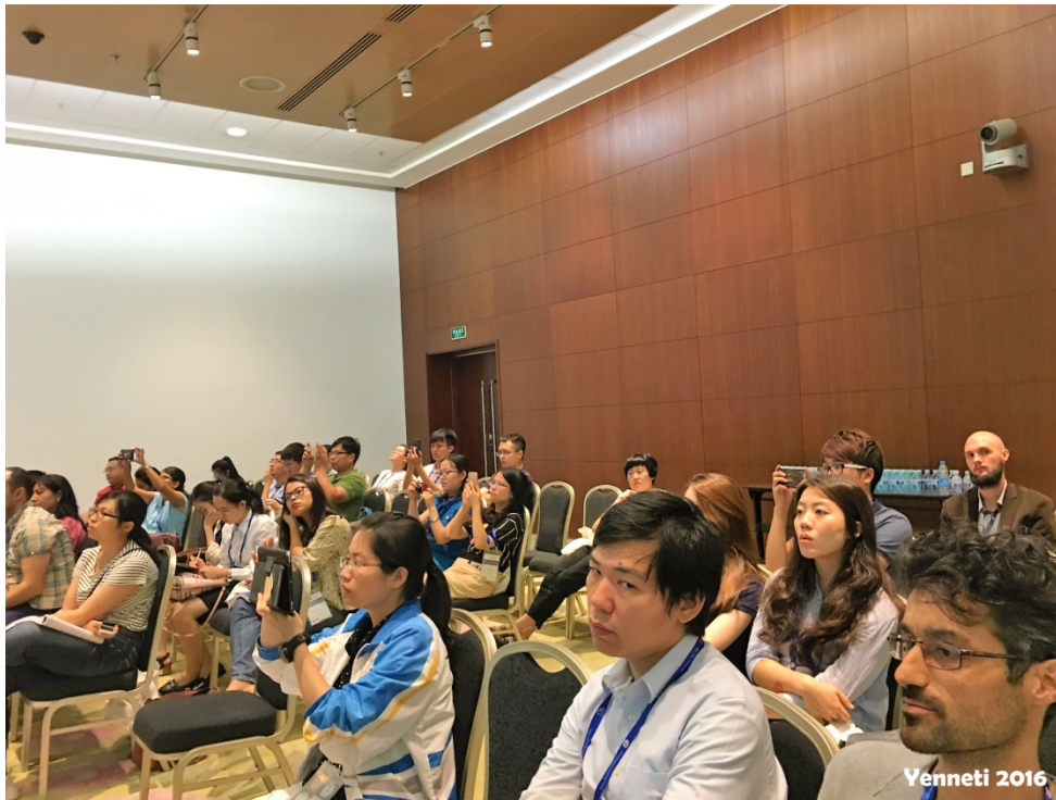
Participants in a Master Class session