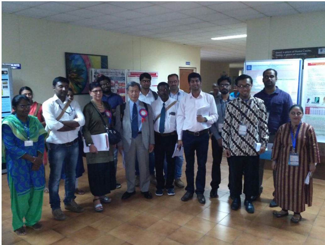
Participants of IGU-YECG Poster Award with jury and IGU-YECG representative