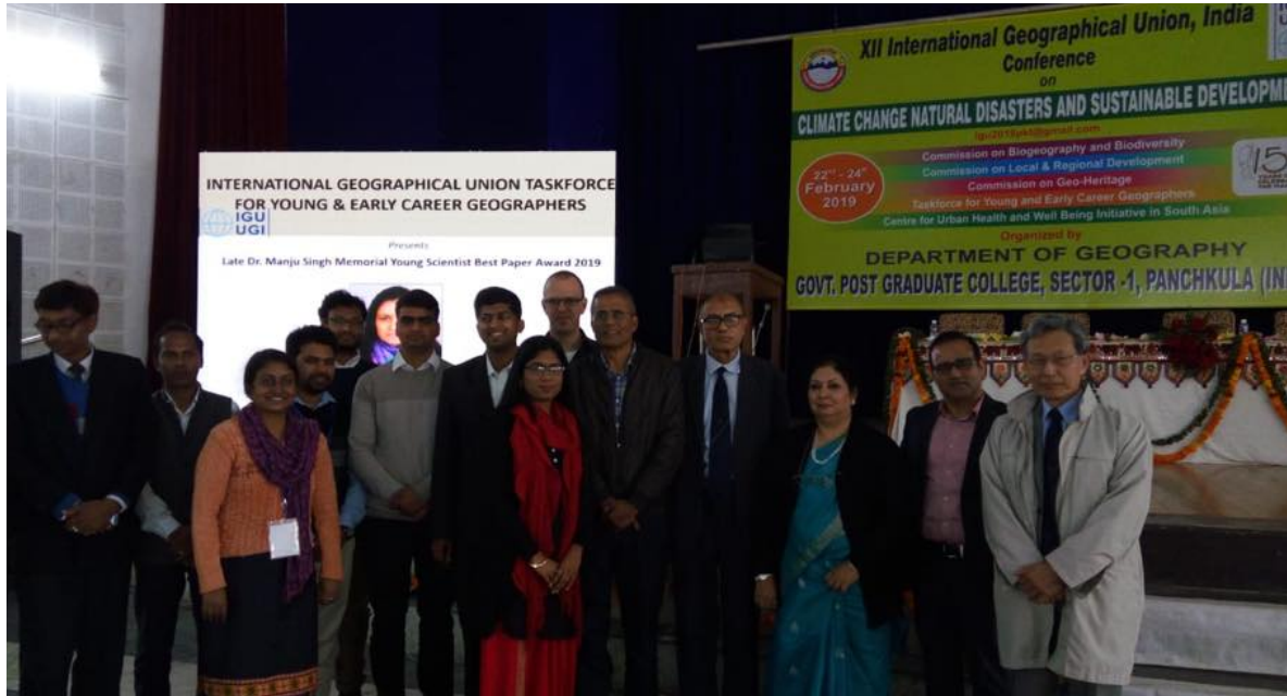
IGU-YECG Session Participants