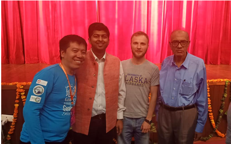
Representatives of IGU-YECG, RGS and YES Network

The meeting yielded fruitful discussion regarding bringing out an IGU-YECG special issue with Geography, Environment and Sustainability (Official journal of Russian Geographical Society). YES Network and IGU-YECG decided to organise common sessions and joint field trips in 2020.