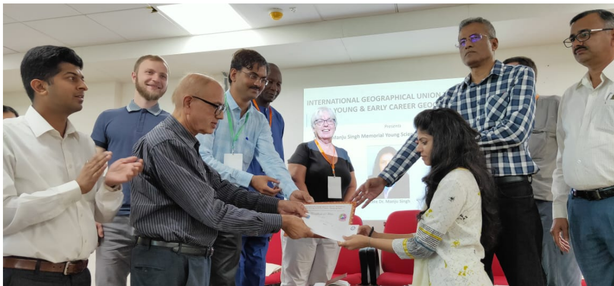
IGU-YECG Best Paper Awardee receiving prize