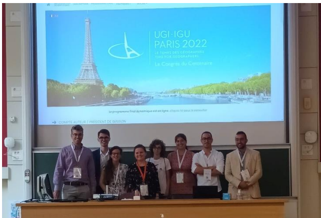
IGUYECG-GEOSUS Session at IGU Paris 2022