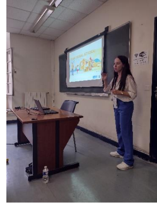
IGUYECG Session at IGU Paris 2022