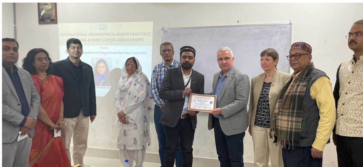
Recipient of IGU-YECG Best Paper Award 2022